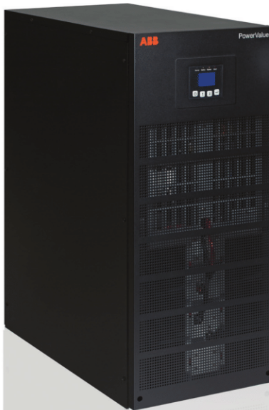
POWERVALUE 31/11 T

ABB's new compact PowerValue 11/31 T UPS slots perfectly into this market segment. It incorporates all the features necessary to deliver reliable power, low running costs, long battery life, easy maintenance and full flexibility for the user.